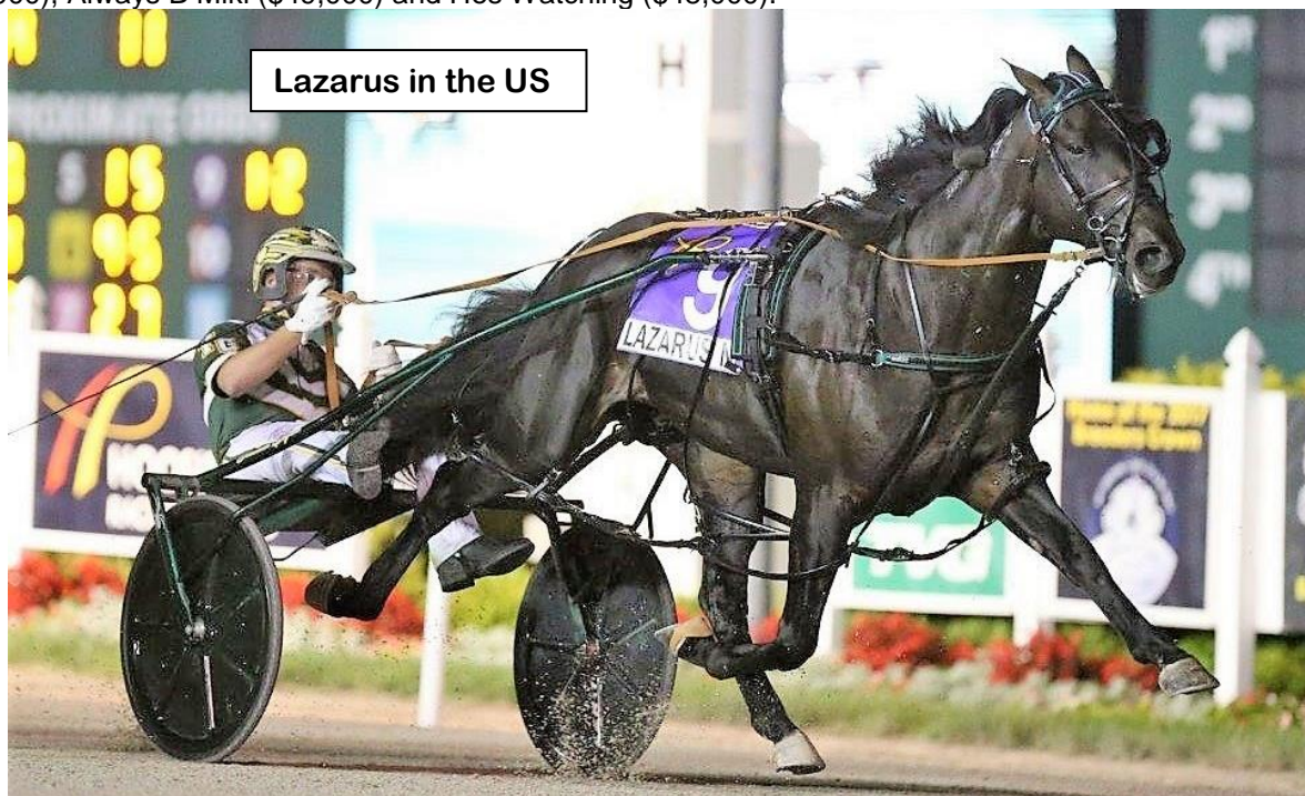
Lazarus in the US

★ The Lexington Select Yearling Sale held in early October was a resounding success, bringing in over $56 million for the 863 plus yearlings. Trotting sires filled 4 of the top 5 places on average price. Leading pacing sires were Captaintreacherous (average $133,000), Sweet Lou ($90,000), Downbytheseaside ($78,000), Bettors Delight ($75,000), Stay Hungry ($62,000), Huntsville ($58,000), Lazarus ($56,000), American Ideal ($53,000), Always B Miki ($49,000) and Hes Watching ($48,000).